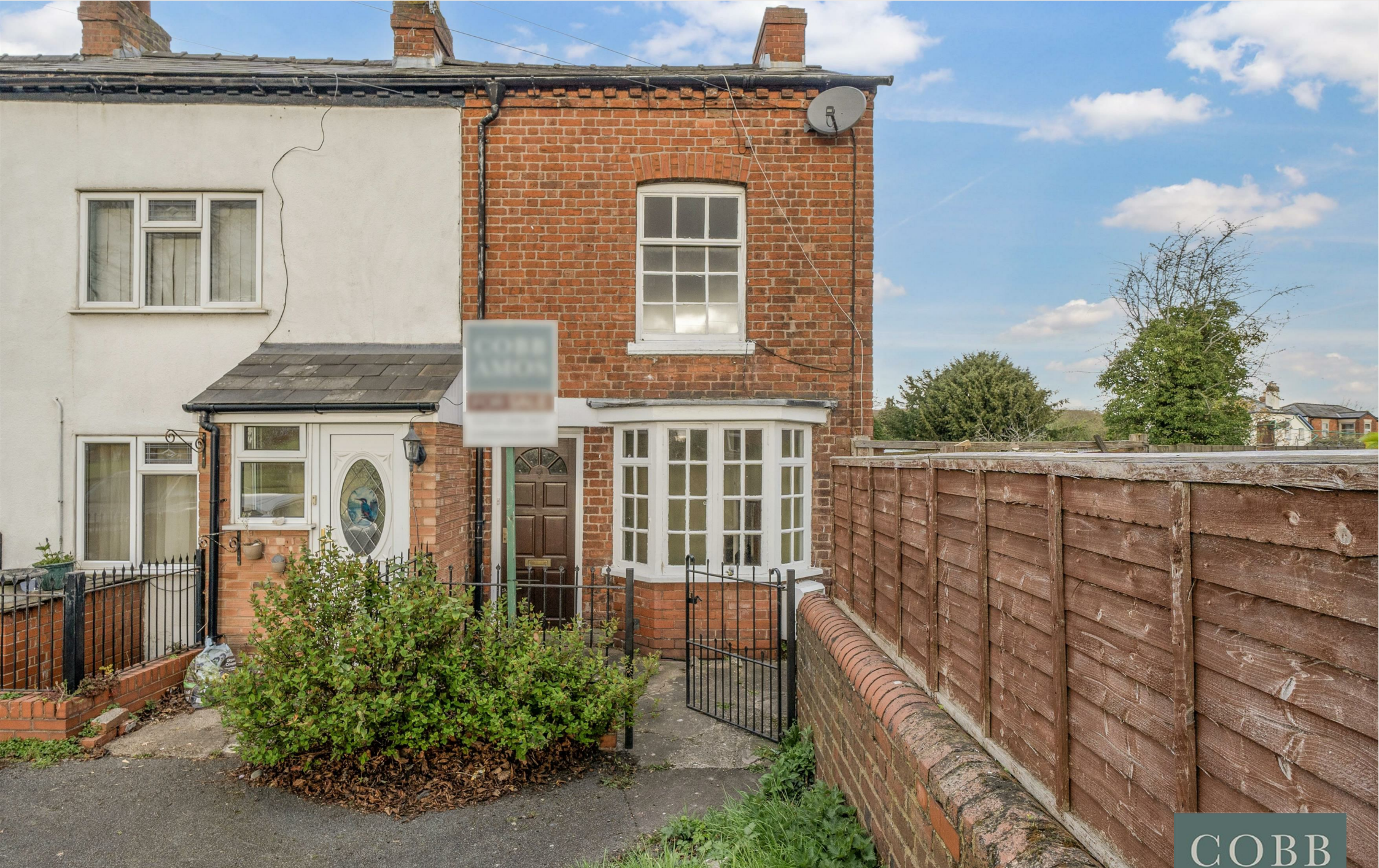
2, Priory Place, Hereford, HR4 9ND Offers Over £200,000